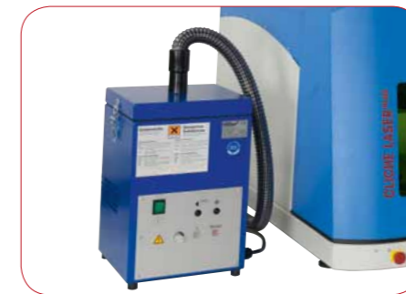
Suction and filter unit (option)