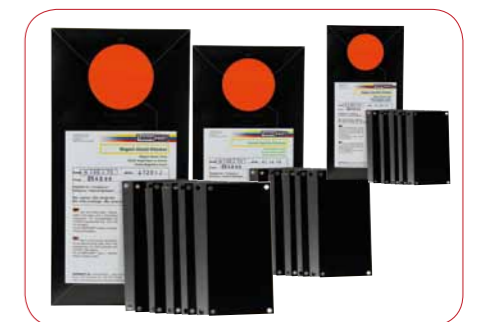
EXCLUSIVE! Pad printing clichés for laser engraving

All clichés that can be laser engraved are specially designed for lasers with a wave length of 1064 nm. Unlimited storage.