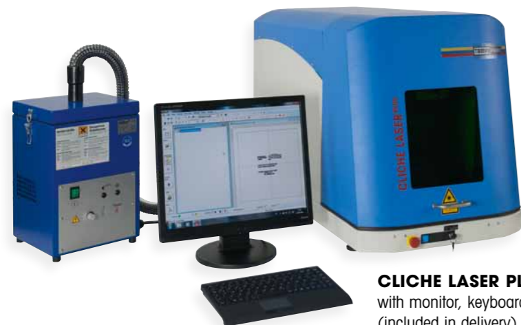
CLICHE LASER PLUS with monitor, keyboard (included in delivery) and suction and filter unit (option)

Enquiries to mailto:seminar@tampoprint.de