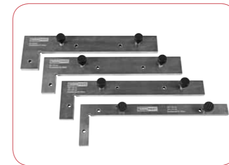
Cliché format adapter for third-party products (option)